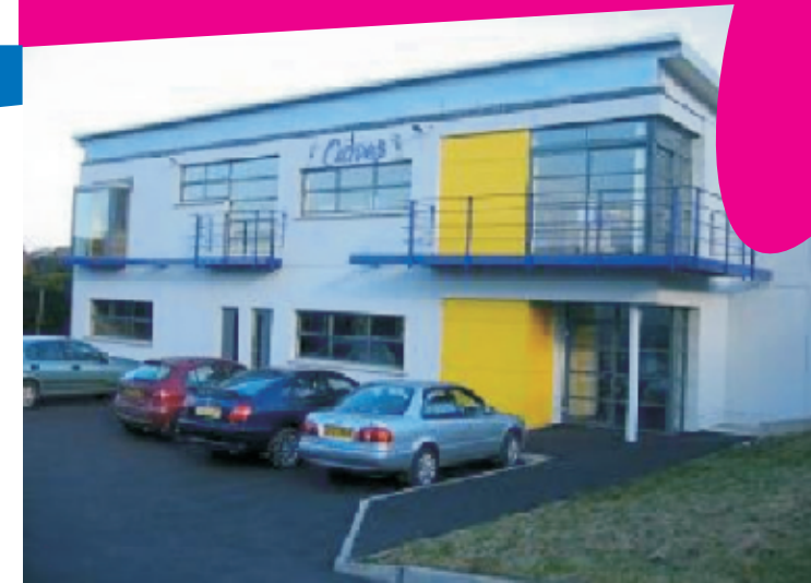
First Step Therapy Centre, Newry Co. Down (Ground Floor)